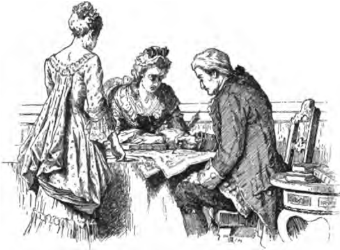
‘They had looked out maps and prints.’

‘We think that you would be a perfectly happy man if you